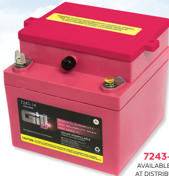
7243-14 AVAILABLE NOW, AT DISTRIBUTORS